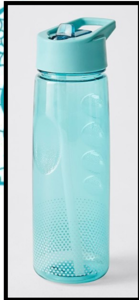
Plastic bottle - easily sterilised!