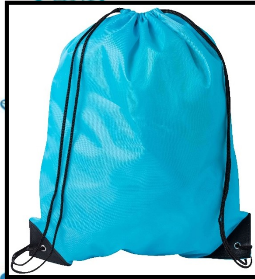
Draw string bag to hold lunch box/plimsolls!