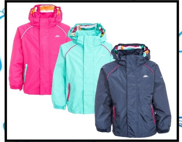
Waterproof coat - or break and lunch play!