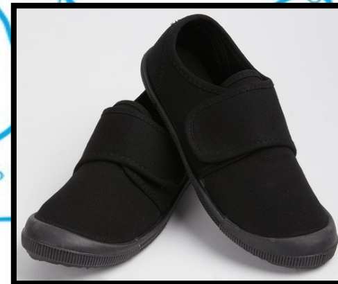
Plimsolls ONLY - for PE