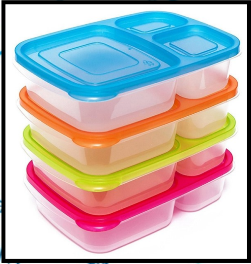
Plastic lunch box - easily sterilised!