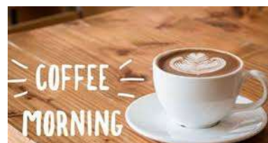
Charlotte Burkett, SENCO