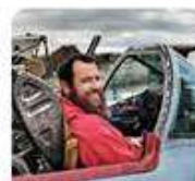
Climb in the Cockpits