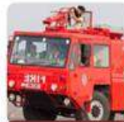
Fire Engine Rides