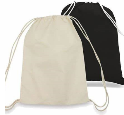
A drawstring bag or a small bag for their belongings

A water bottle. Please provide your child with water for during the day. Children can have a flavoured drink such as squash for lunch time.