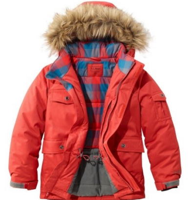
A coat on rainy or cold days.

A water bottle. Please provide your child with water for during the day. Children can have a flavoured drink such as squash for lunch time.