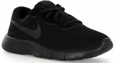
Shoes for PE

Please provide your child with a plastic lunch box so that it can easily be cleaned upon your child's arrival to school.