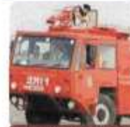
Fire Engine Rides

12TH AND 13TH APRIL | 10AM TO 4PM | RAF MANSTON HISTORY MUSEUM CT12 5DF