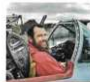
Climb in the Cockpits