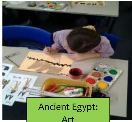
Ancient Egypt: Art