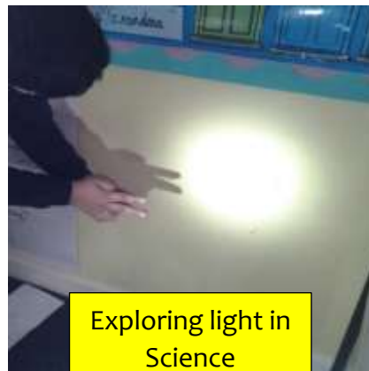
Exploring light in Science