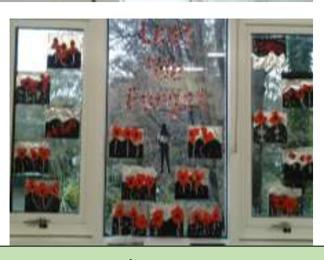
Remembrance Day Art