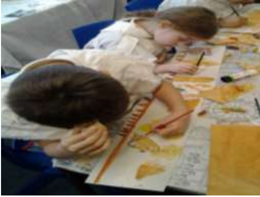
Ancient Egypt: Art