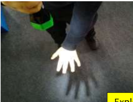
Exploring light in Science